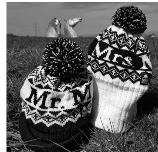
Exhibit 1 — Wonky Woolies’ website extract

The business also creates one-off orders, for example customised wedding hats. This includes the customer choosing the colours, the type of fibre and finalising the design template. The business works closely with the customer to ensure the end result is exactly what they wished for.