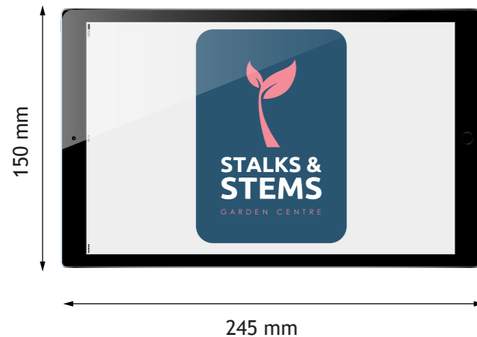
Tablet size — 8 mm thick