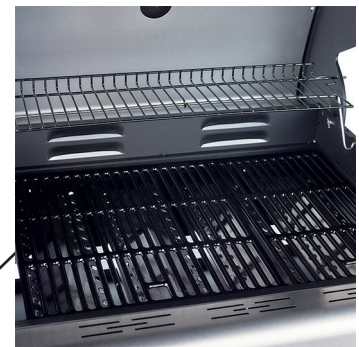
Barbecue with lid open